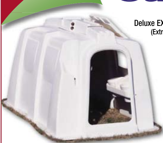
Deluxe EXL Calf Hutch (Extra Large)